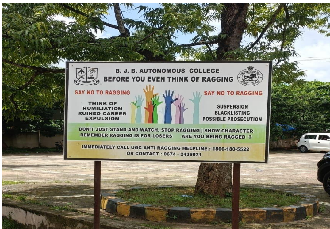
CAMPUS AWARENESS TOWARDS RAGGING NEAR HEI PARKING