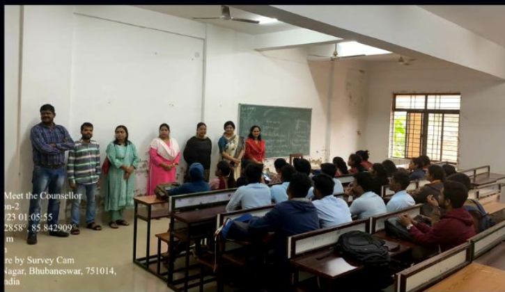
Meet the Counsellor!! m-2 23 01:05:55 28.58° , 85.842909° m re by Survey Cam Nagar, Bhubaneswar, 751014, dia