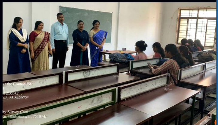
Meet the Counsellor!! 12:35:42 14° , 85.842972° by Survey Cam ar, Bhubaneswar, 751014, a