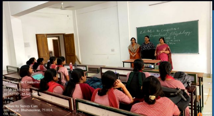
Let's Meet the Counsellor!! Sessions 11/08/23 09:30-10:30 20.23730° , 85.842972° 38.6 m -1.0 m Capture by Survey Cam BJB Nagar, Bhubaneswar, 751014, OR, India

Group Counseling session conducted by the department of Psychology for students of Psychology, History, Sanskrit, Political Science and Economics respectively.