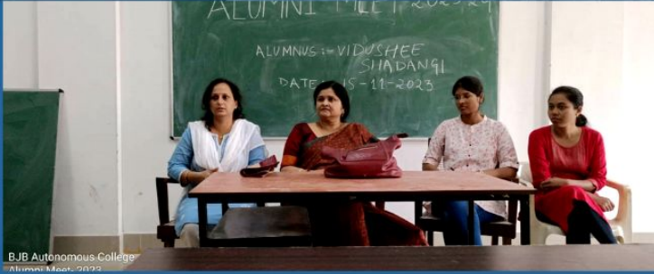
BJB Autonomous College Alumni Meet, 2023